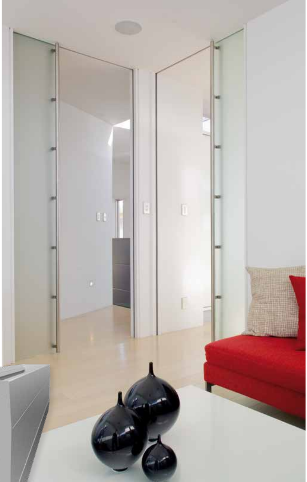
Pocket doors with CS Frameless Glass track systems.

Use this system for a distinctive, smooth running, reliable frameless glass sliding door.