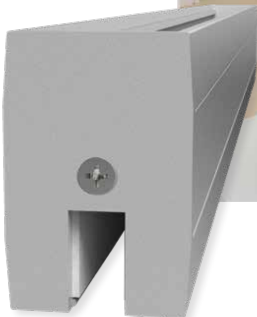
CS Frameless Glass clamp system.