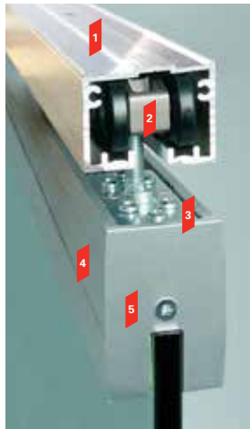
CS Frameless Glass clamp system with CS Pocket track, M8 carriage and mounting plate

Our engineers focus on constantly developing new products and refining existing ones. That's why our products come with a number of unique features: