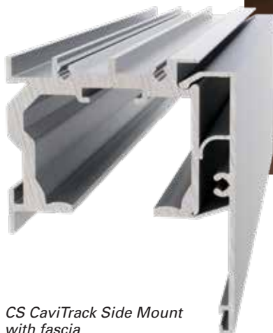
CS CaviTrack Side Mount with fascia