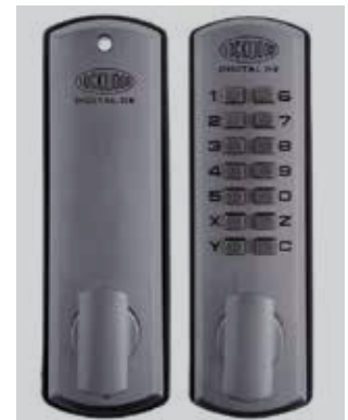
Digital locks are easily programmable and full instructions are included.