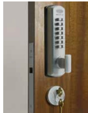
CL100 DigiLock with key locking fitted to a timber veneer door.

Drawings & pictures are not to scale. All dimensions in inches (and mm).