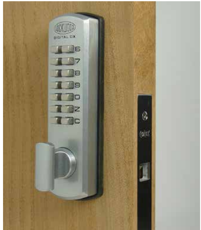
CL100 DigiLock fitted to a timber veneer door.