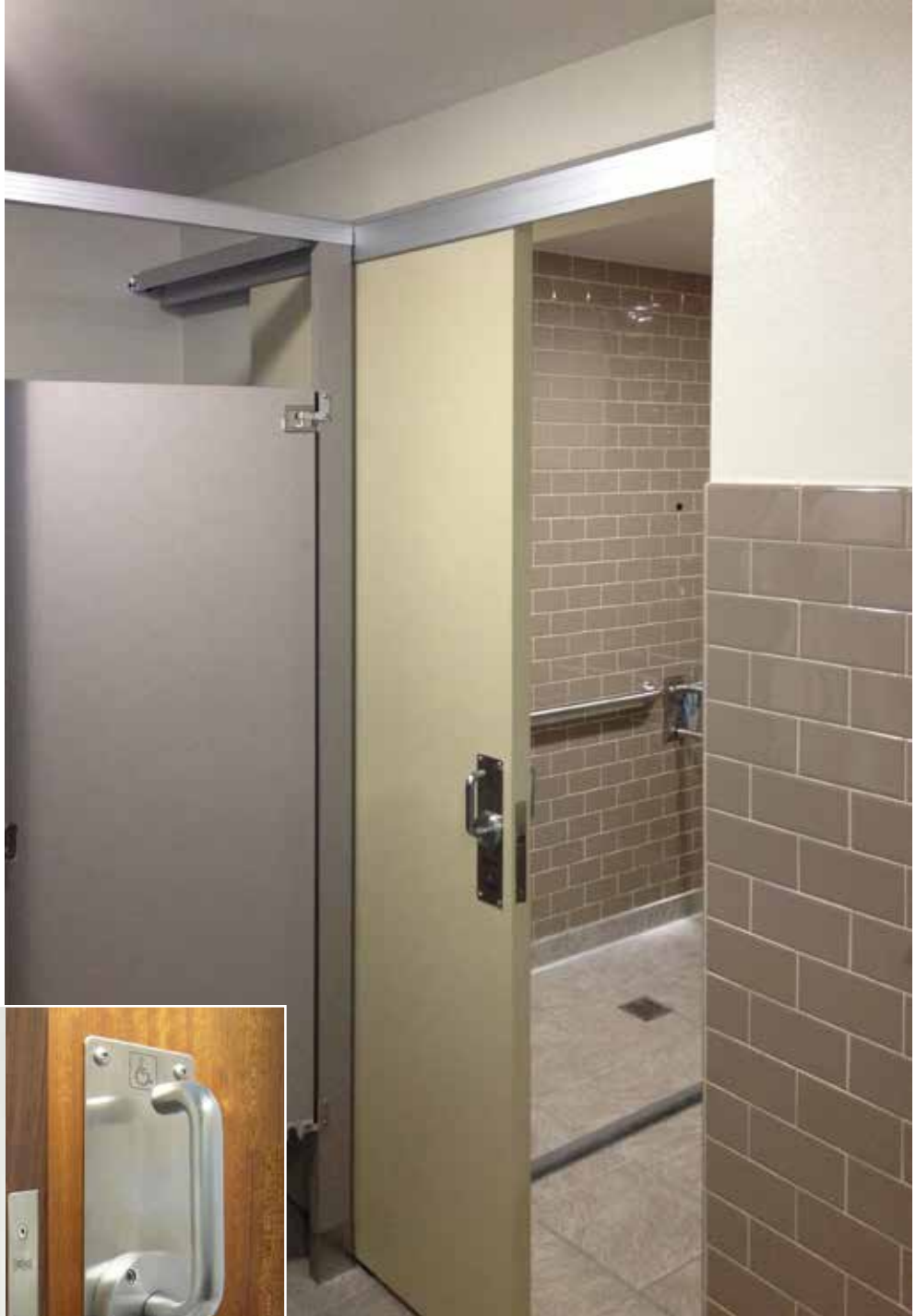
CaviLock CL100 LaviLock in Satin Chrome fitted to door mounted on CS WallMount Track