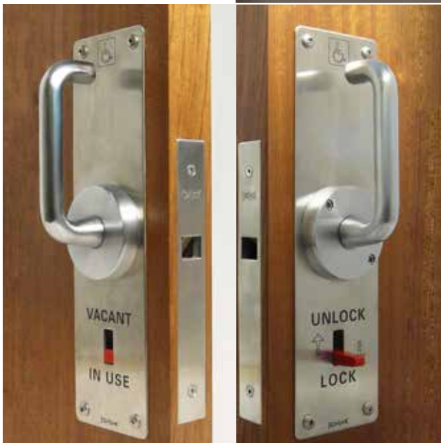
'Vacant/In Use' indicator plate with Emergency Release on outside door face.